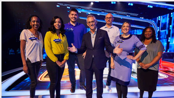
Sitting On A Fortune Sunday, 6pm 12th December ITV

Pulse-quickenig quiz hosted by Gary Lineker. Six players compete to be in the right place at the right time to take away a life-changing amount of money.