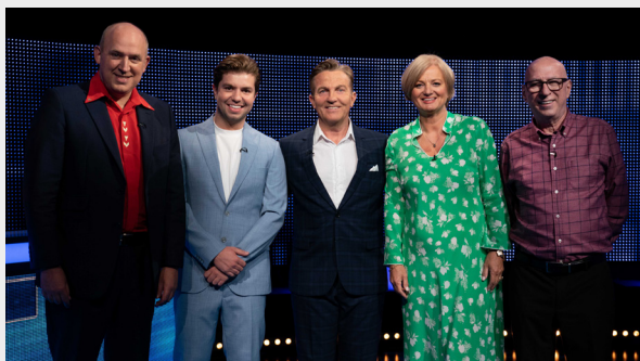
The Chase Celebrity Special Sunday, 7pm 12th December ITV

Contestants can win tens of thousands of pounds just by answering a single question. All they have to do is stay in the money chair until the end of the show to try and scoop the jackpot. This time, Matt, Candice, LaToya, Marie, Ciaran and Kate compete.