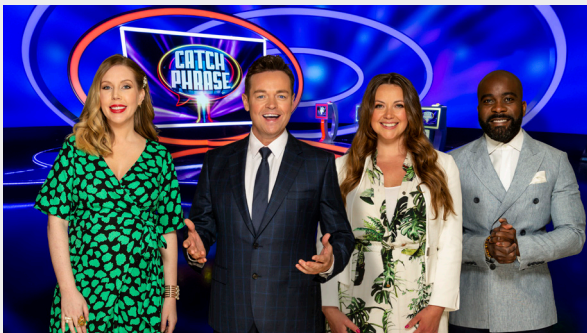
Celebrity Catchphrase Saturday, 7pm 11th December ITV