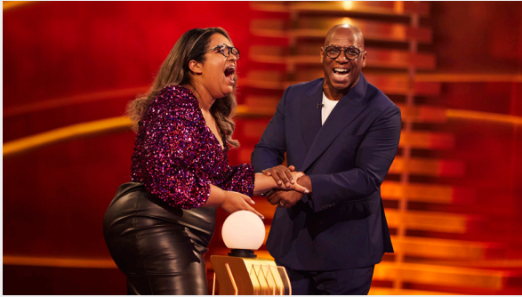
Moneyball Saturday, 6pm 11th December ITV

Game show hosted by Ian Wright, where the difference between the contestants winning big and going home with nothing rests entirely on the bounce of a ball.